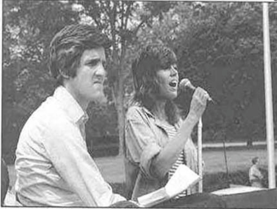
Actress And Anti-War Activist Jane Fonda Speaks to a crowd of Vietnam Veterans as Activist and former Vietnam Vet John Kerry (LEFT) listens and prepares to speak next concerning the war in Vietnam